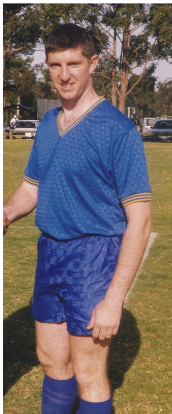
-James as a player in 1996