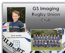
Personalised front cover