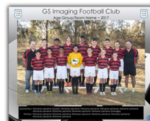
10"x8" Group with names