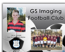
Personalised front cover