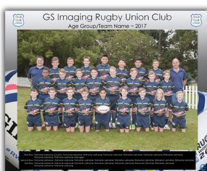
10"x8" Group with names