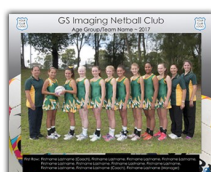
10"x8" Group with names