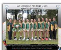
10"x8" Group with names