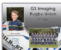
Personalised front cover