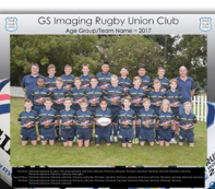
10"x8" Group with names