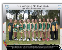
10"x8" Group with names