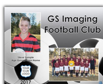
Personalised front cover