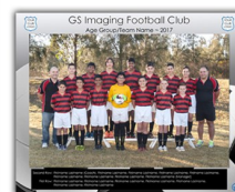
10"x8" Group with names